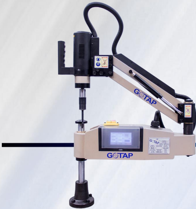
MOD. REV M10